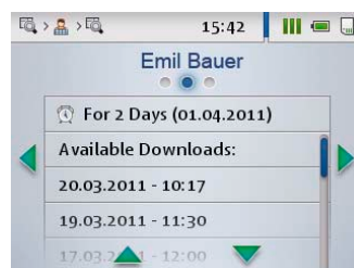
Detailed view of existing and due downloads