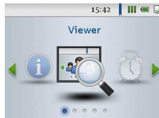
View data on the Key

Order no. for DLKPro Neoprene Case: A2C59514917